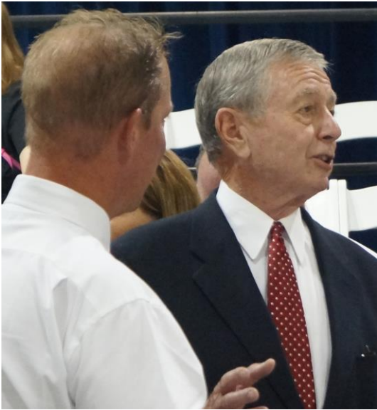
Former US AG John Ashcroft