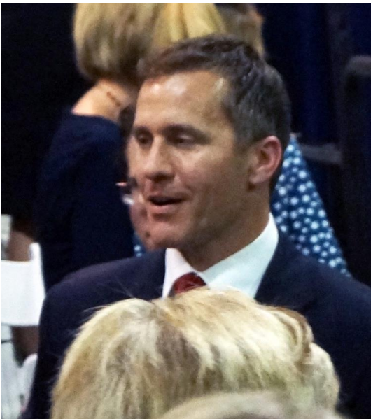
MO Governor Eric Greitens