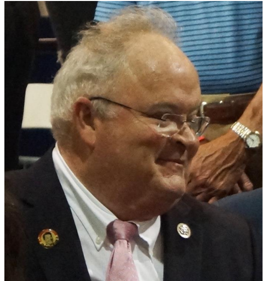
US Congressman Billy Long